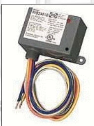
RIB Power Relay