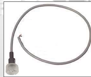
PSR-1 Light Level Sensor